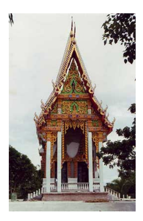
The journey begins with a visit to the temple. The artwork is so very rich in symbolism of the higher levels of human consciousness!