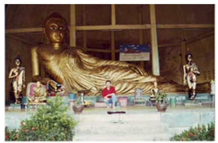
Reclining Gold Buddha at Suphanburi Province, Thailand